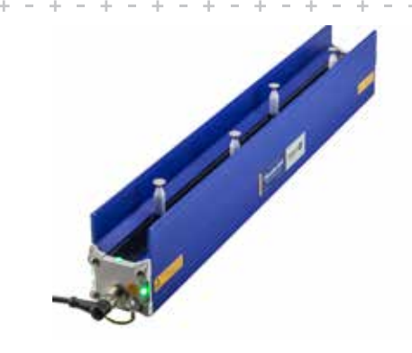
ThunderION 2.0 HD withouth support -and end brackets for easy cleaning