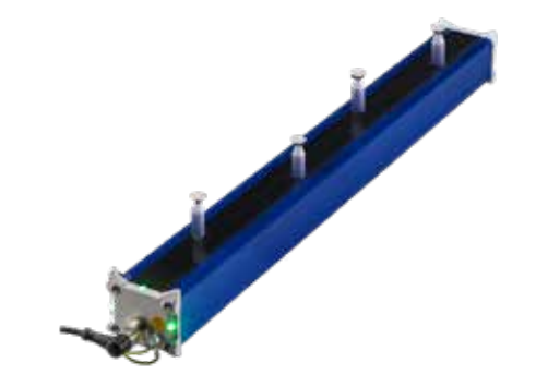
ThunderION 2.0 HD without support brackets, end brackets and sideplates for easy cleaning